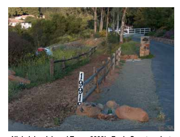
Nick Jakawich and Troop 2000's Eagle Scout project

(Ed note: Elfin Forest will soon have a new trail created from the unpaved portion of Questhaven Rd. It has been closed since last year, and gates are now being constructed, so please remember to use an alternate route. Only emergency vehicles are permitted on that section of the road.)